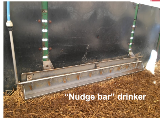
"Nudge bar" drinker

MAKE SURE THE PIGS ARE NOT KEPT SHORT OF WATER!